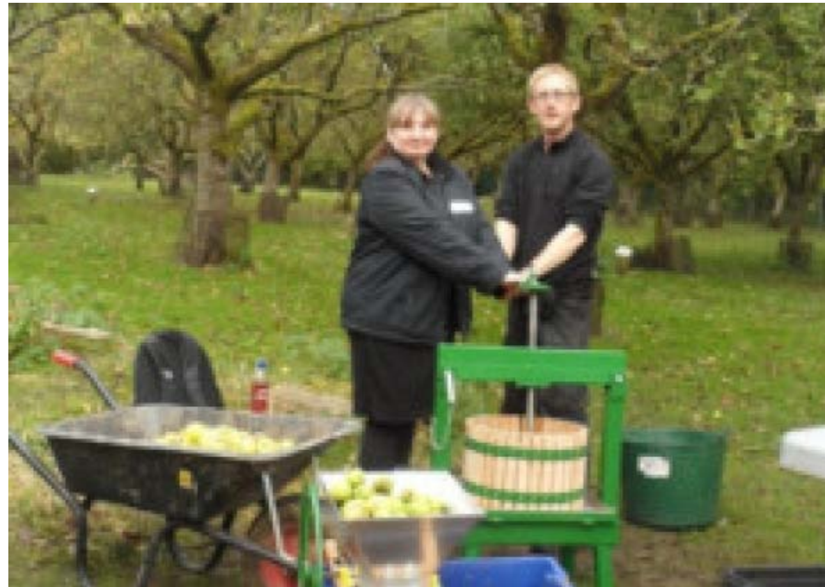
Fruits of labour: Apples are pressed into juice

Published on Wednesday 14 November 2012 09:19