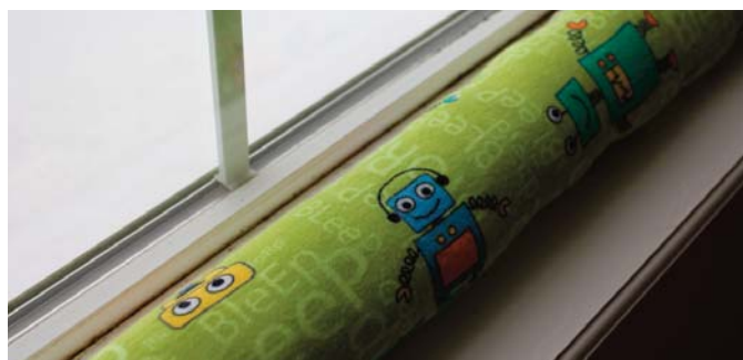
A robot-themed draught-proofing snake for the window in a child's bedroom

Never block boiler flues, air bricks, or window trickle vents and avoid over draught-proofing windows in kitchens and bathrooms where the moist air needs to escape.